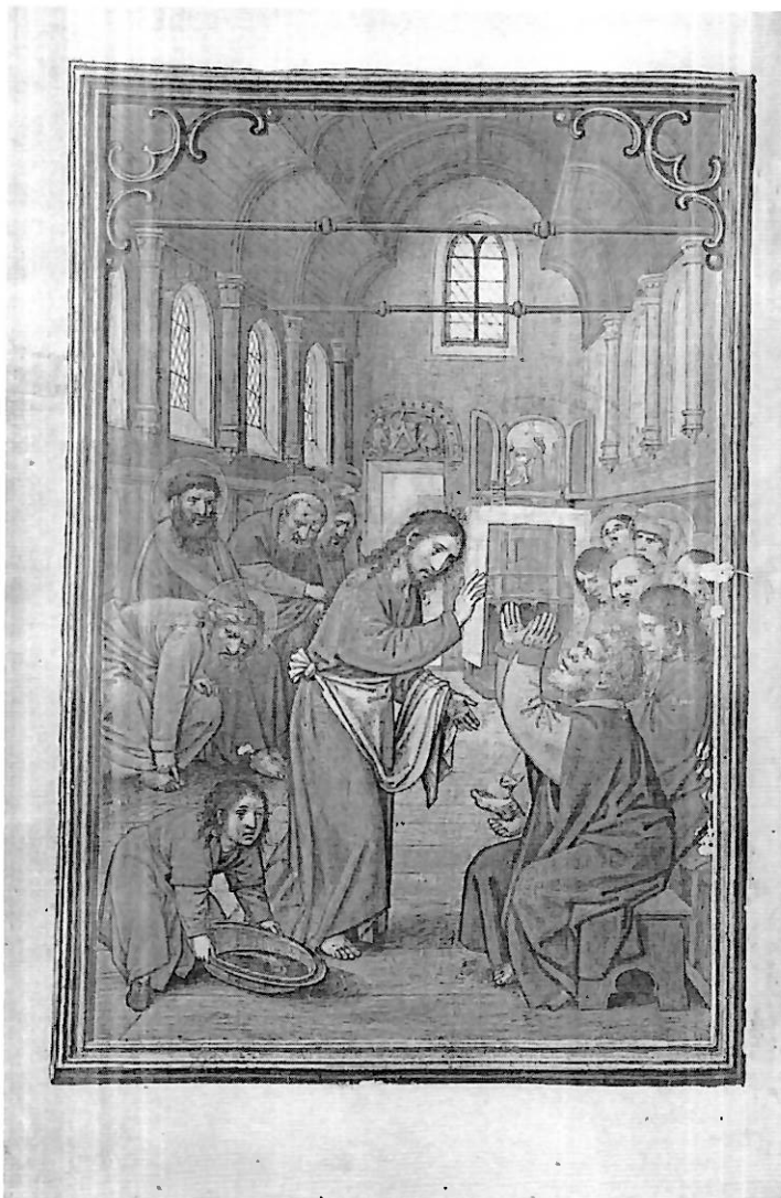
Christ Washing the Apostles' Feet, by Simon Bening, c. 1525-1530. The J. Paul Getty Museum, Los Angeles, California.